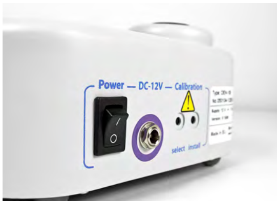
DEN-1B rear side with calibration controls